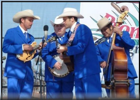
Central Valley Boys